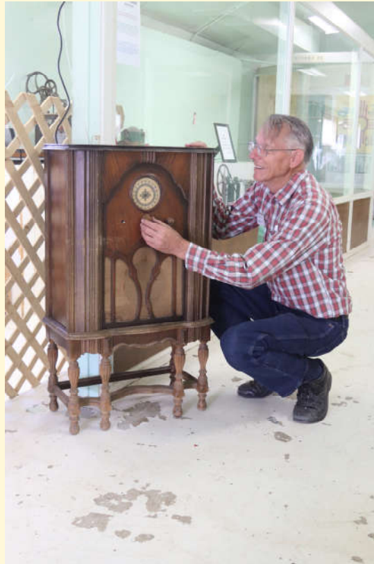
N5CWW shows his Old Radio at the SNMST