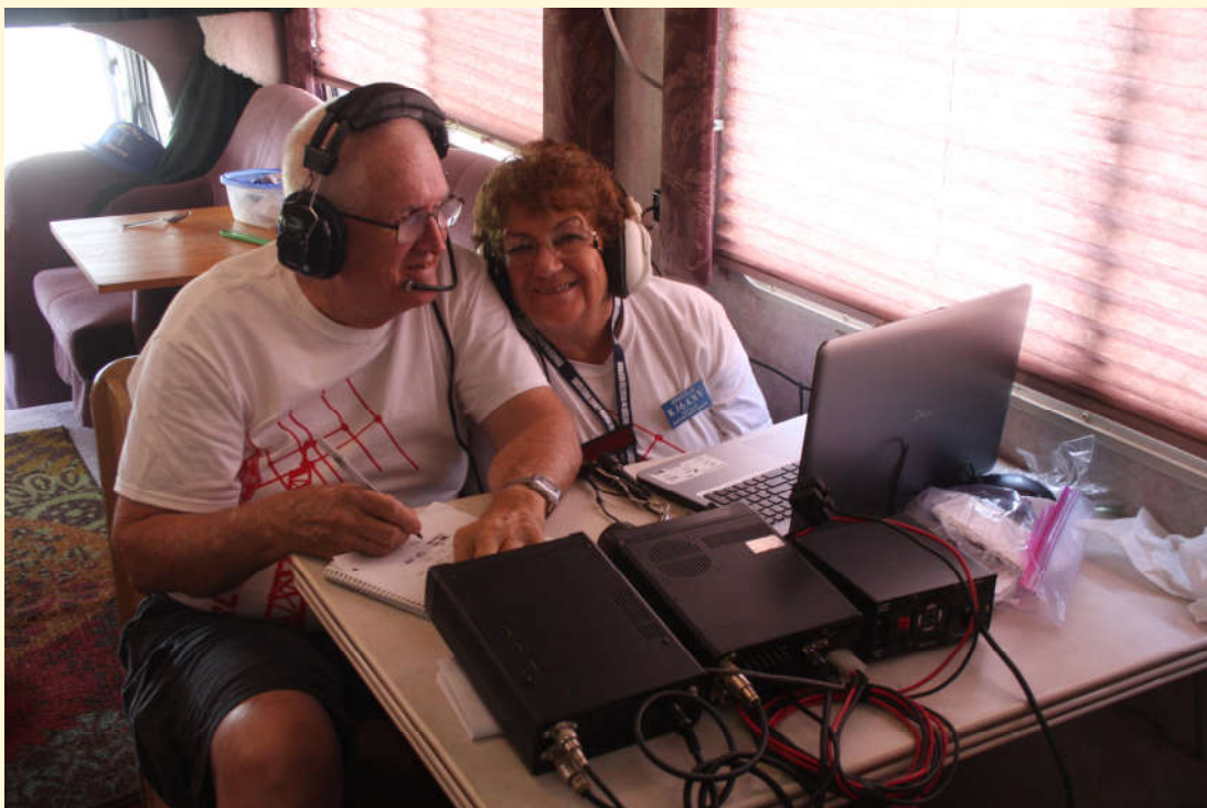
WA5DJJ and KJ6ANV at the 20 meter position