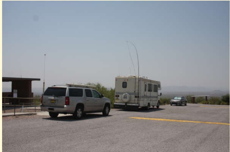
Field Day Vehicles